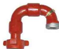
STYLE NO. 50 MxF Union Ends