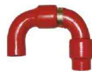
STYLE NO. 50 Threaded Ends