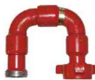
STYLE NO. 10 MxF Union Ends