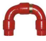
STYLE NO. 10 Threaded Ends