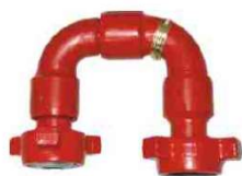
STYLE NO. 10 MxM Union Ends